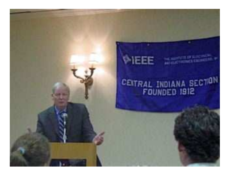
* * * * *