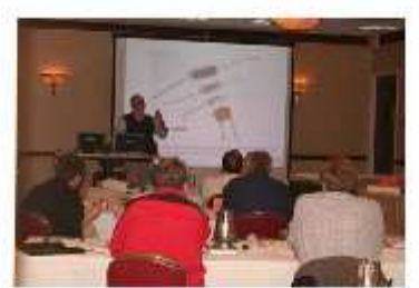
Don't just hear about it