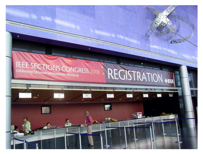
More information? http://www.ieee.org/web/volunteers/sections-congress/2008/index.html