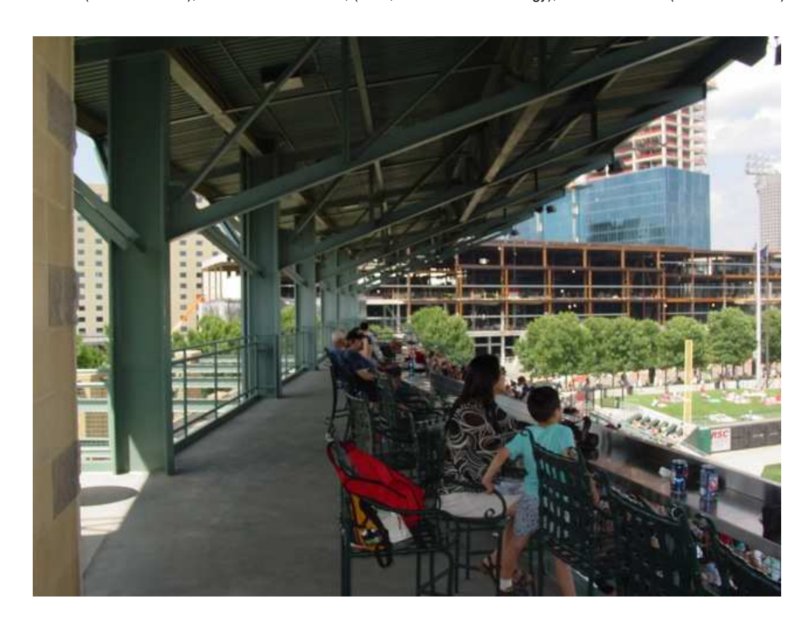
Full chairs all the way down! We also had the whole party deck to the left and behind.