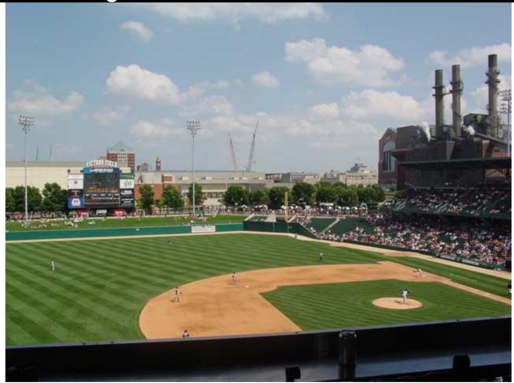
Great view of the game and the downtown Indy skyline!